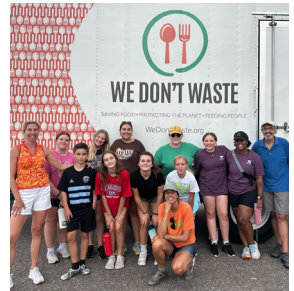
Middle School Mission Trip 2023