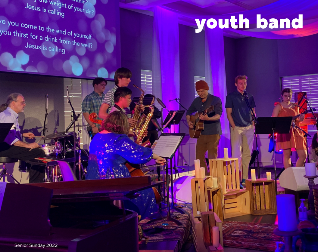
Senior Sunday 2022

The Youth Band is open to any middle and high schoolers who play an instrument: drums, guitars, keyboards, violins, cellos, saxophones, trumpets, trombones, singers, rappers, songwriters, and sound technicians. You name it, we'll work with it - all are welcome! The band performs on Wednesdays at GPS (for middle schoolers) and Sundays at SNL (for high schoolers). Former band members have become nurses, scientists, musicians, engineers, baristas, mountain climbers, administrative assistants, and parents, but the one thing they all had in common was a passion for music.