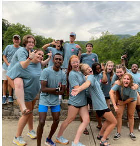
Montreat Youth Conference 2023