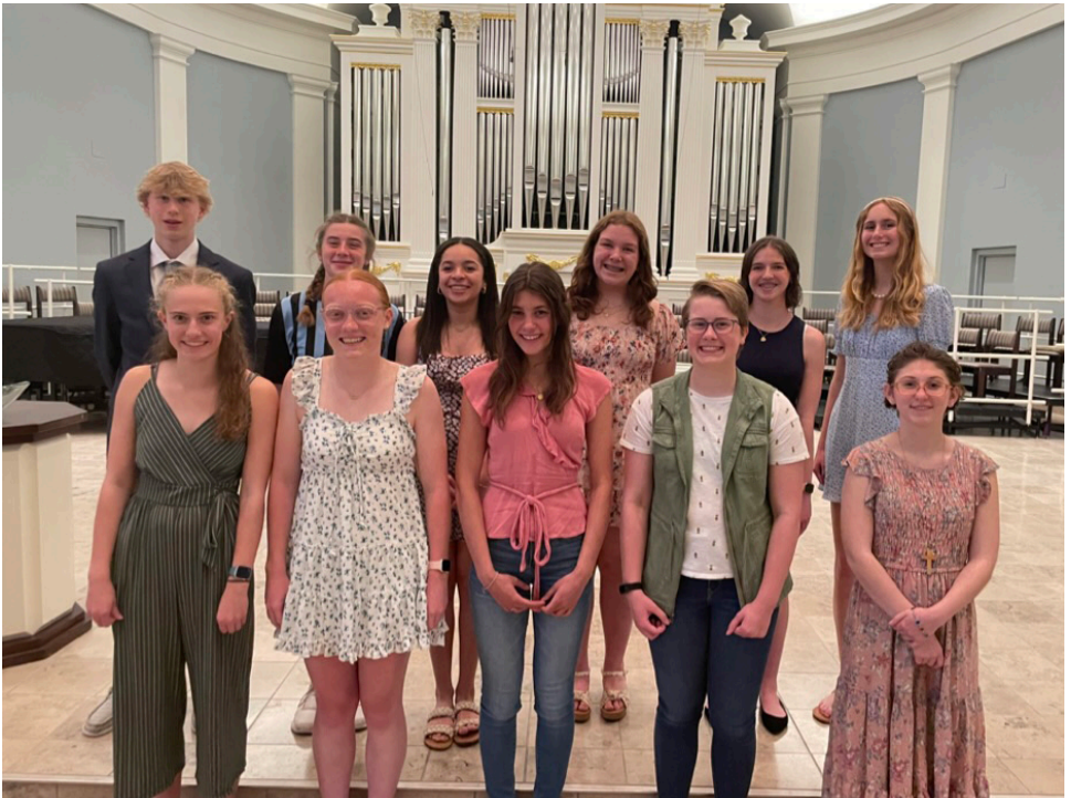
Confirmation Sunday 2023

If you are an adult interested in leading a small group, let us know. We'd love to have you!