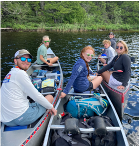
Boundary Waters 2022

Join us on a week-long canoe and camping adventure in the gorgeous lakes of Boundary Waters, Minnesota (right on the Canadian border!) National Geographic named Boundary Waters as one of their 50 trips of a lifetime. We only take this trip every other year, so now's your chance. No experience is necessary.