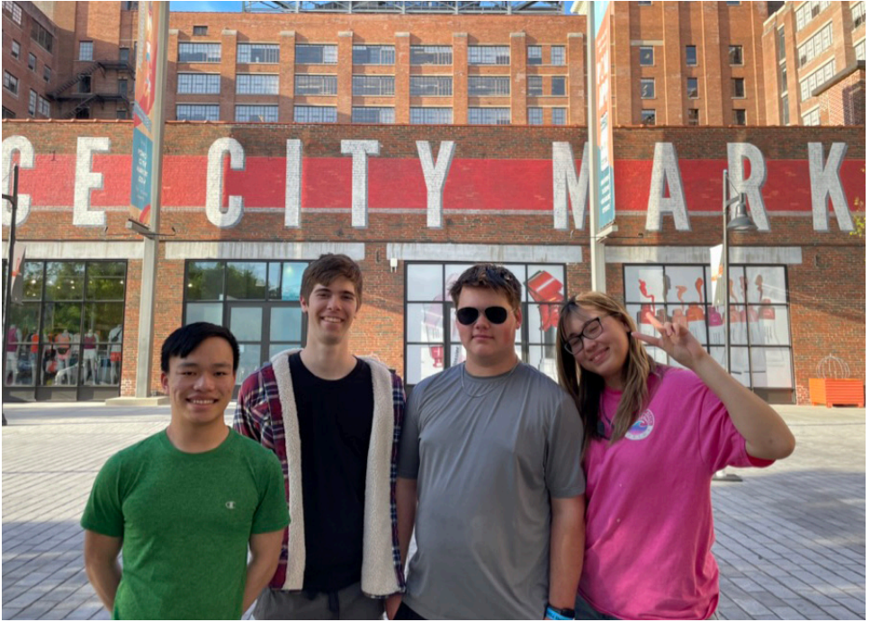
Capstone Class of 2023

When you leave high school, a lot of changes are in your near future: living more independently, meeting a wide variety of people from different backgrounds, and growing as a person. You change a lot in and after high school, and your faith journey is no different. This class for high school seniors is where we discuss what life and faith look like in the next chapter of life, and how to approach it thoughtfully and intentionally.