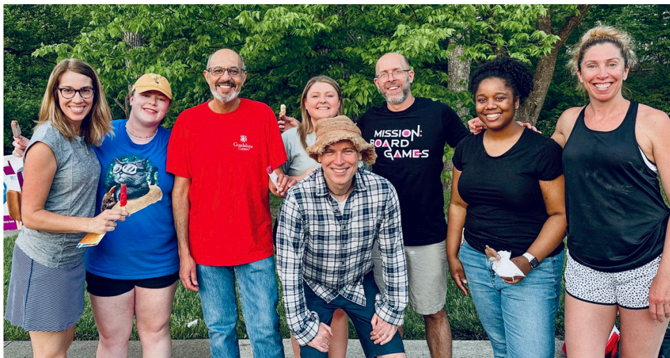
GPS Volunteers at Messy Game Night, 2023